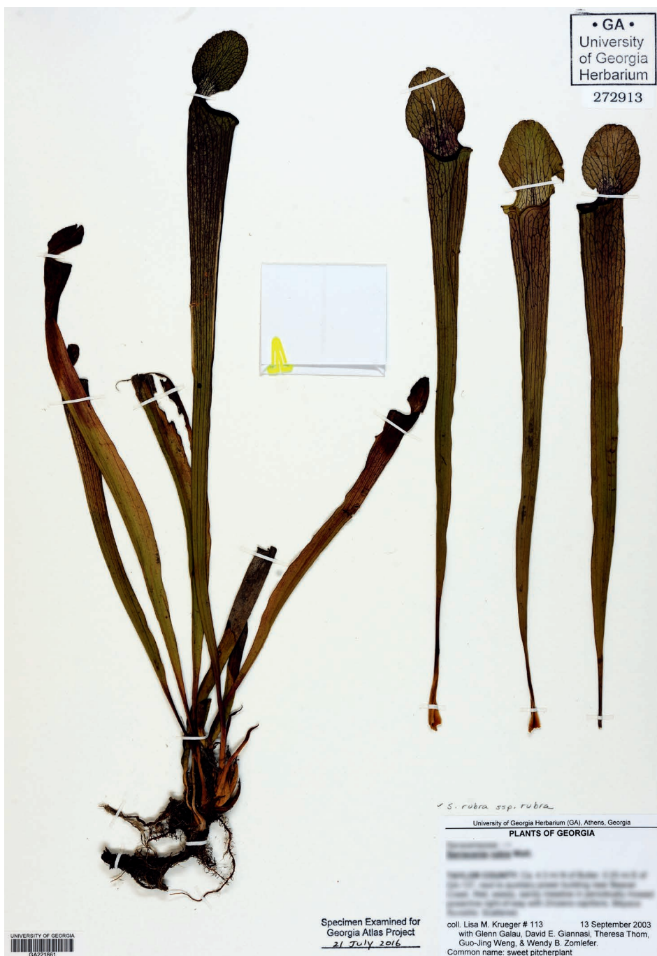
Figure 1: Sarracenia rubra subsp. viatorum specimen at the University of Georgia Herbarium. Some portions of the image blurred for security reasons.